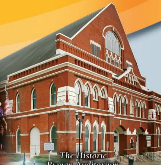
The Historic Ryman Auditorium