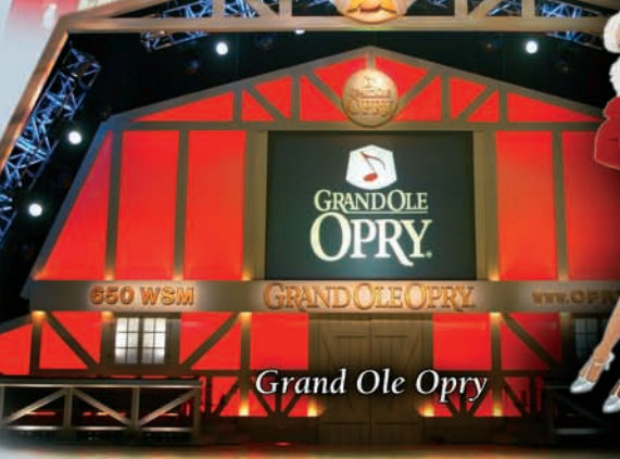
Grand Ole Opry