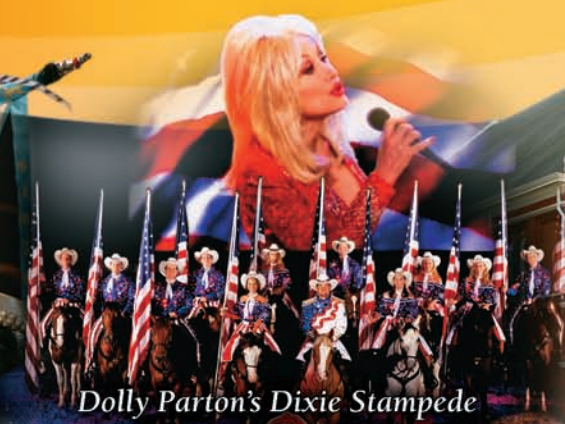
Dolly Parton's Dixie Stampede