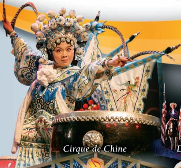
Cirque de Chine

NASHVILLE PIGEON FORGE Great Smoky Mountains Tour