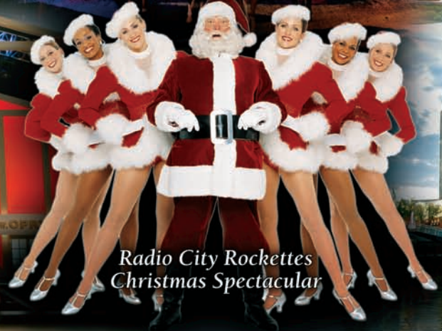
Radio City Rockettes Christmas Spectacular