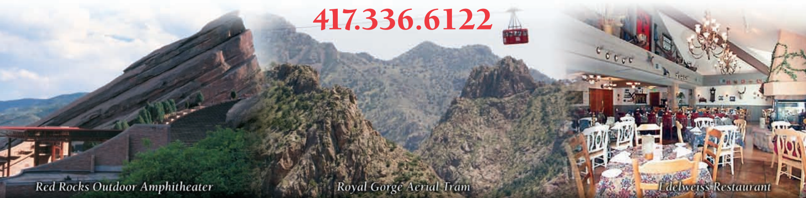
Red Rocks Outdoor Amphitheater