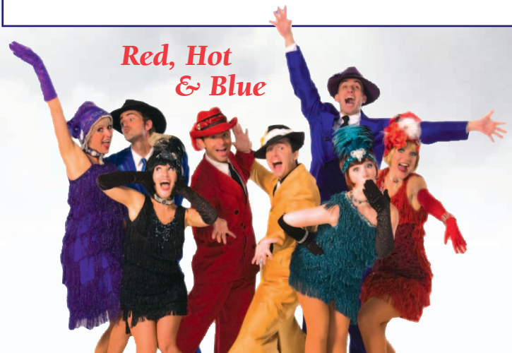
Red, Hot & Blue